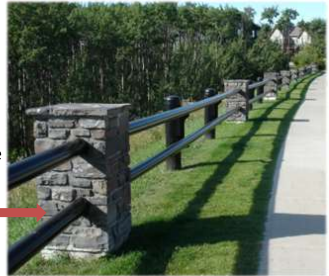
Stone pillar & metal railing fences along the ravine and adjacent to Wentworth Drive