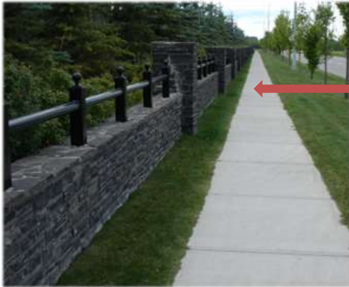
Stone and metal perimeter walls